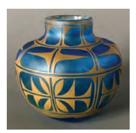
Star Fire by Ira lujan Taos pueblo Blown Glass

714 1st Avenue North (727) 822-7872 MoreanArtsCenter.org info@moreanartscenter.org Monday-Saturday 10am - 5pm Sunday 12pm - 5pm View live glassblowing demonstrations daily included in the price of the Chihuly Collection ticket, and experience the home of the largest art glass store in Tampa Bay! No ticket required for store entrance.