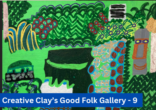
Creative Clay's Good Folk Gallery - 9