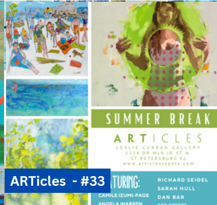
ARTicles - #33