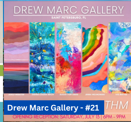
Drew Marc Gallery - #21 THM OPENING RECEPTION: SATURDAY, JULY 13 | 6PM - 9PM