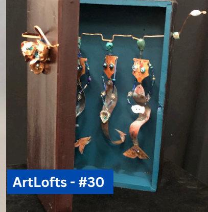
ArtLofts - #30