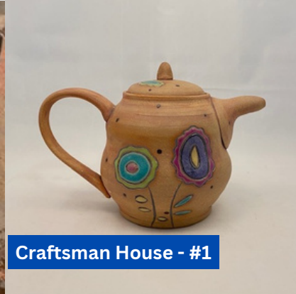
Craftsman House - #1