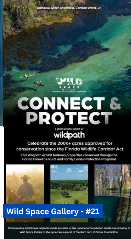
Wild Space Gallery - #21

This traveling exhibit was originally made possible by the Jacarlene Foundation and is now showing at Wild Space thanks to the generous support of the Ruth and JO Stone Foundation.