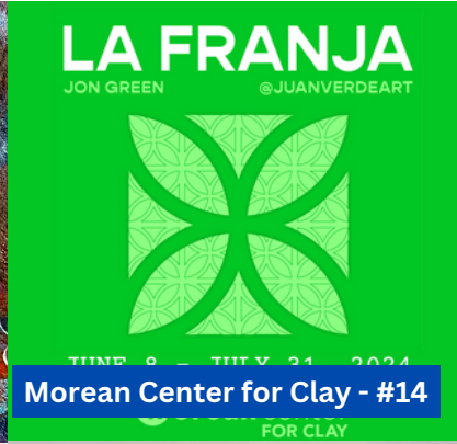
Morean Center for Clay - #14