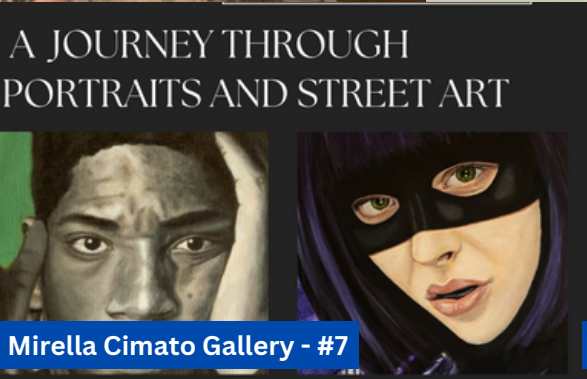
Mirella Cimato Gallery - #7