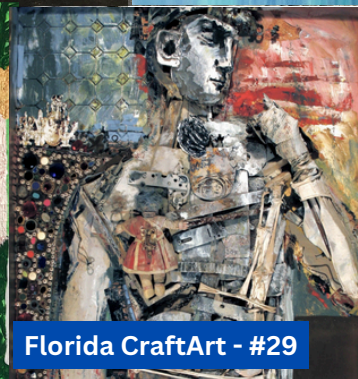
Florida CraftArt - #29