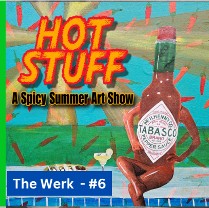
The Werk - #6