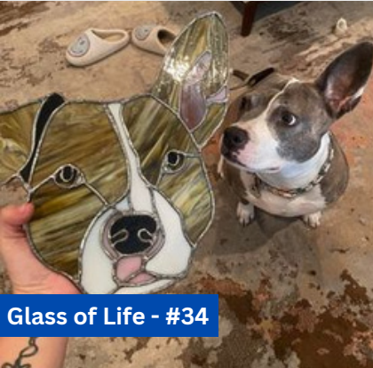
Glass of Life - #34