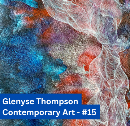
Glenyse Thompson Contemporary Art - #15